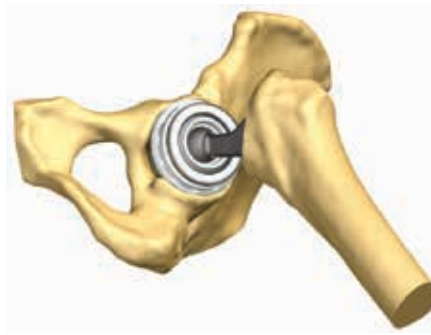
2. Reduce hip

In the event that dislocation is required, the head removal tool may be used. Fully insert the tip of the appropriated sized removal tool inside the inner bearing (around the femoral head) and hold until the femoral head is dislocated.