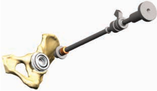
1. Liner impaction