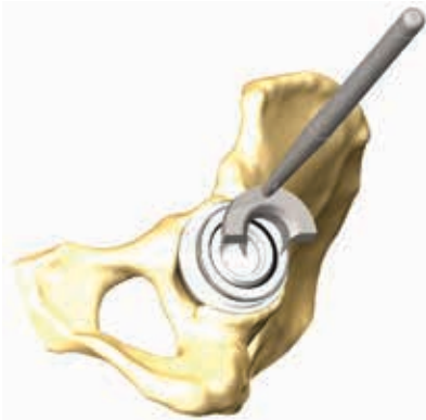
3. Removal tool positioning

In the event that dislocation is required, the head removal tool may be used. Fully insert the tip of the appropriated sized removal tool inside the inner bearing (around the femoral head) and hold until the femoral head is dislocated.