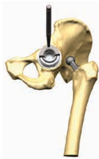
4. Femoral head removal