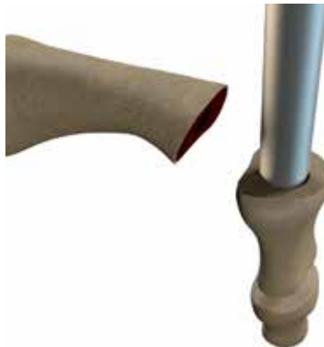
Figure 12: Insert the middle phalanx implant