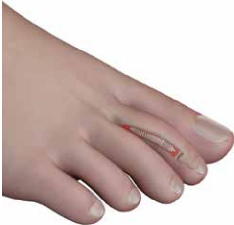
Figure 18. Completed repair