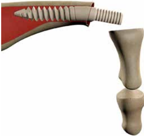
Figure 16: Insert the implant until the barbs on the implant should reach the osteotomy site.