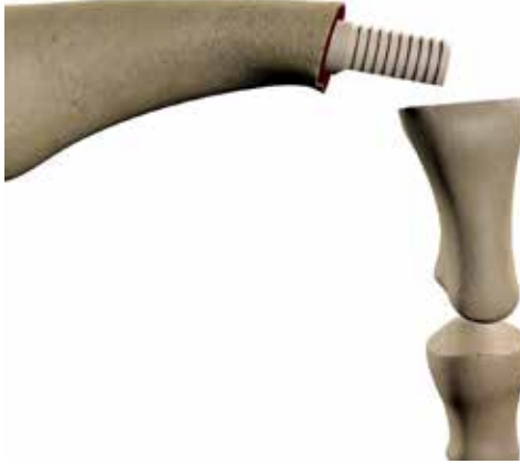
Figure 15: Insert the proximal phalanx implant

Note: For a 10° implant, utilize the laser mark on the 10° driver shaft to achieve the desired orientation