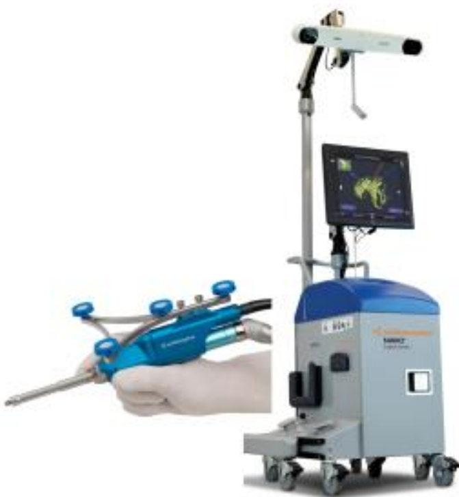
NAVIO ® Surgical System