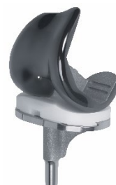
GENESIS ® II Knee System