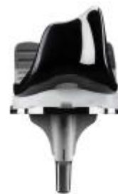
JOURNEY ® II Knee System