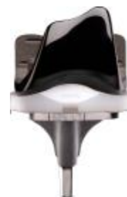
LEGION ® Knee System